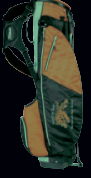
Lightweight Stand Bag Available in 11 colors