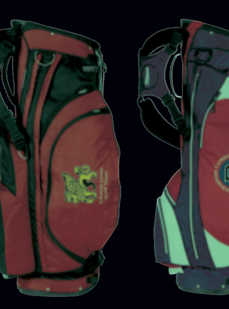
Premium Stand Bag Available in 6 colors