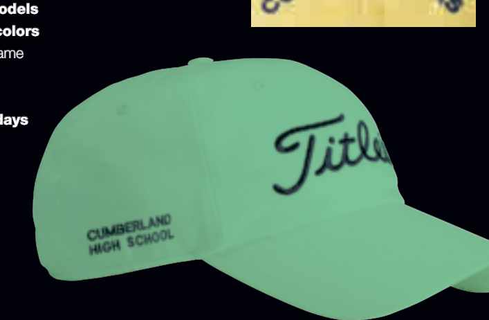
Headwear available in 14 colors